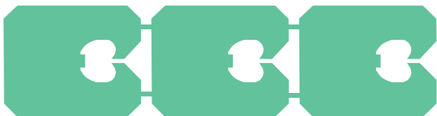
Series R (Medium Duty) & Series S (Heavy Duty)

The machine can also close packages with Series R and S closures. However these closures cannot be printed. The 1002FP is portable. Its suction cup feet allow it to be used on any clean flat surface. With bolt holes being pre-drilled it can be permanently mounted if desired (bolts are not included).